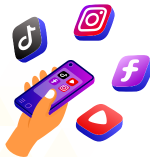
Different Social media platforms