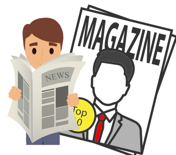
Magazines & Newspaper