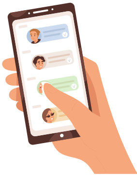
Personal/Networking / Reference Contacts

You can source RKGF from the following sources (however this is just an indicative list)